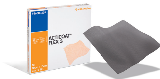
ACTICOAT ® FLEX 3 Antimicrobial Barrier Dressing

The wounds had epithelialised and the patient was advised to apply emollient moisturiser twice daily to the area.