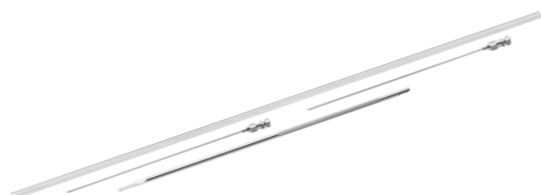
CAP-FIX Blade, Curved, with Hip Pac #72205319

Smith & Nephew Pty Ltd Australia T +61 2 9857 3999 F +61 2 9857 3900 Smith & Nephew Ltd New Zealand T +64 9 820 2840 F +64 9 820 2841 www.smith-nephew.com/australia www.smith-nephew.com/new-zealand °Trademark of Smith & Nephew. All trademarks acknowledged. 21896-anz V1 SN14918 REV0 05/20