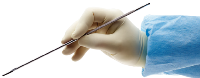
CAP-FIX ◇ Capsulotomy Blade