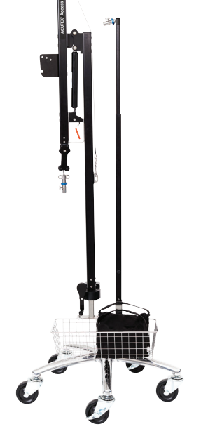
ACUFEX Access Positioning System shown on cart in storage configuration.