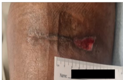
Figure 3. End of evaluation (4.5 weeks since NPWT discontinuation)

After 35 days of treatment, the wound was capable of being managed solely with ACTICOAT™ FLEX Dressings and ALLEVYN™ Wound Dressings.