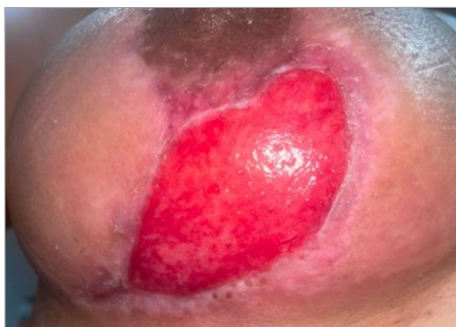
Figure 11. End of evaluation (21 days of PICO™ sNPWT)

After 3 weeks of PICO™ sNPWT, the wound was ready for skin grafting; however, the patient preferred not to have any further surgery. Consequently, PICO™ sNPWT was continued.