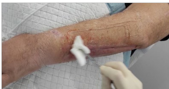
Figure 5. End of evaluation (NPWT discontinuation) after 4 weeks of RENASYS™ tNPWT and 3 weeks of PICO™ sNPWT

The combination of RENASYS™ tNPWT, gauze wound filler and PICO™ sNPWT was considered a successful step-across approach in this patient.