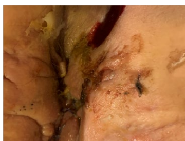
Figure 8. End of evaluation (NPWT discontinuation after 1 week of PICO™ sNPWT)

Following 22 days of NPWT therapy (2 weeks of RENASYS™ tNPWT and 1 week of PICO™ sNPWT), surgical site infection was avoided, wound care was managed at home and conventional dressings were deemed sufficient. The patient reported regaining sexual function, less fibrosis, and an overall improvement in quality of life.