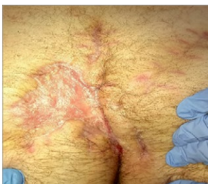
Figure 9. End of evaluation (4 weeks since NPWT discontinuation)

After 54 days of treatment (3 weeks of RENASYS™ tNPWT and 4 weeks of PICO™ sNPWT), treatment goals were met: healthy granulation tissue was present, the surrounding area of the wound was healing, and no further dressing changes were necessary. Skin graft healing was supported by PICO™ sNPWT, which was introduced while the patient was still in hospital and continued in the patient's home after discharge.