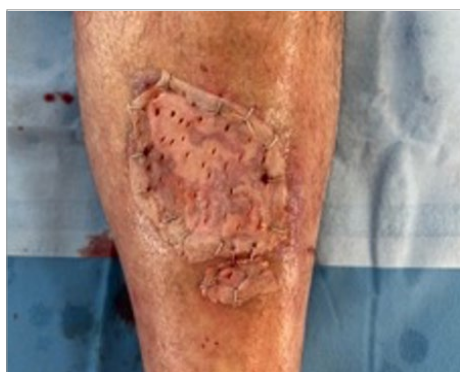
Figure 10. Post skin-graft (NPWT discontinuation after 18 days of PICO™ sNPWT)

The patient did not experience any discomfort during the 18 days of PICO™ sNPWT, the treatment goals were achieved and the skin was ready for grafting.