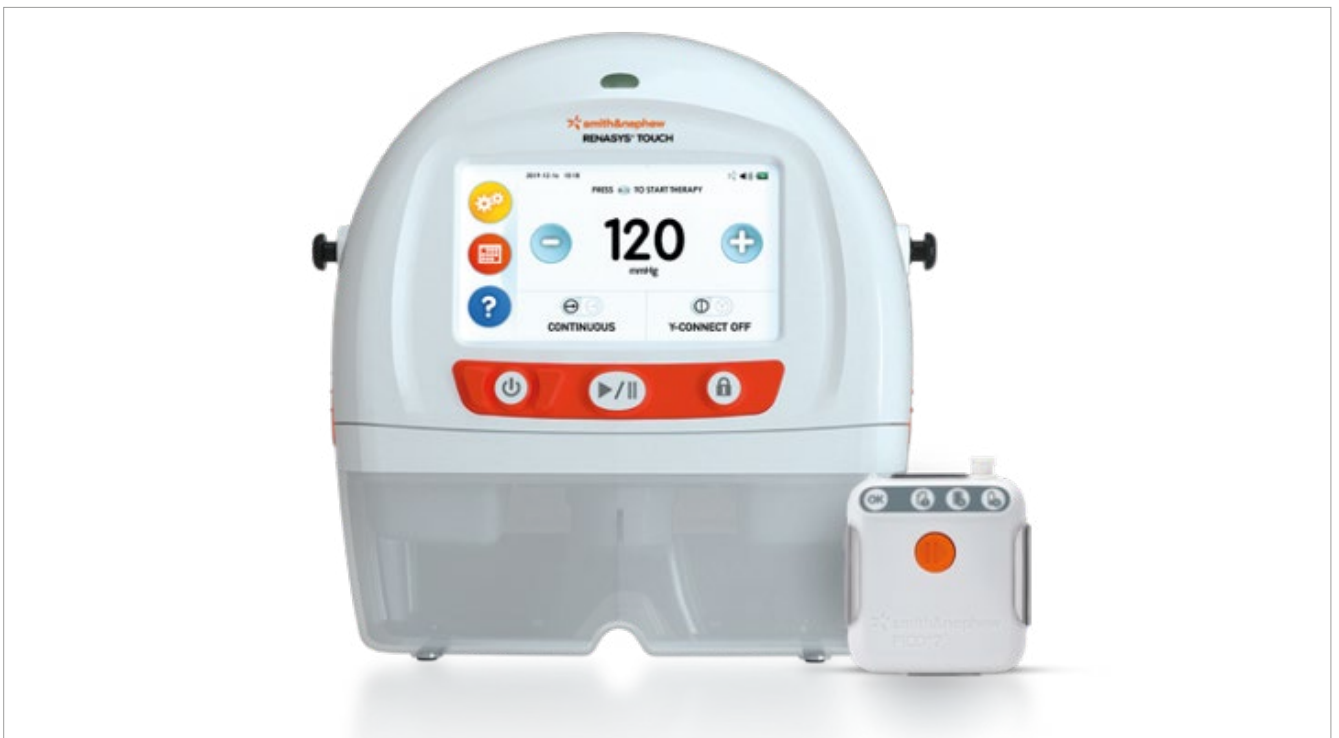
Figure 2. RENASYS™ Negative Pressure Wound Therapy System and PICO™ Single Use Negative Pressure Wound Therapy.