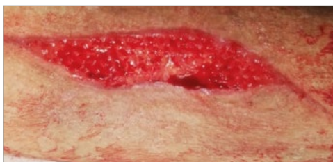
Figure 6. End of evaluation (NPWT discontinuation following 2 weeks of PICO™ sNPWT)

With each regular patient visit, the exudate level and wound cavity size decreased, indicating that the use of RENASYS™ tNPWT and PICO™ sNPWT had significantly accelerated the healing process. The patient had comorbidities and an initial poor general condition, but she felt no pain during her treatment with NPWT and was relieved that she didn't need surgery or any other alternative procedures e.g. skin grafts.