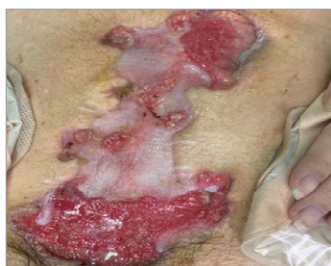
Figure 7. End of evaluation (NPWT discontinuation following 6 weeks of PICO™ sNPWT)

After a total of 14 weeks of treatment with NPWT (3 weeks of PICO™ sNPWT, 5 weeks of RENASYS™ tNPWT, followed by an additional 6 weeks of PICO™ sNPWT), the patient's wound was capable of being managed with ACTICOAT™ FLEX Dressing. With good epithelialisation in progress, a healthy wound bed and no pain, the patient reported that she was very satisfied with the treatment.