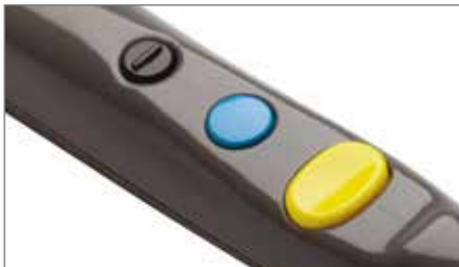
Improved Integrated Finger Switch (IFS) Technology.