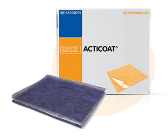
ACTICOAT♦ Antimicrobial Barrier Dressings