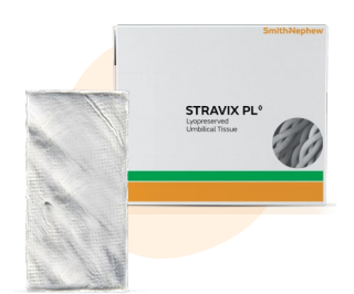
STRAVIXO Umbilical Tissue Products