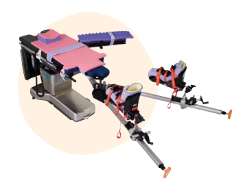
HIP POSITIONING SYSTEM Supine and Lateral Hip Positioning Portfolio