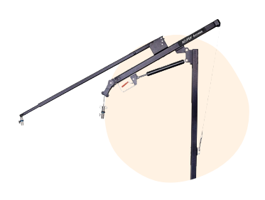
ACUFEX ACCESS Positioning System