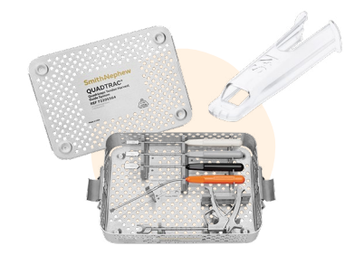
QUADTRACO Quadriceps Tendon Harvest Guide System