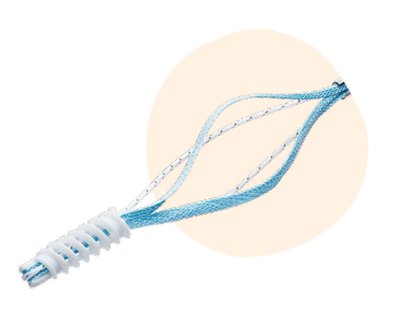
HEALICOIL<sup>6</sup> REGENESORB<sup>6</sup> Suture Anchor