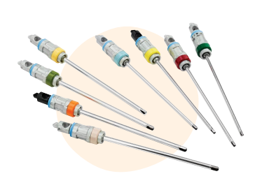
DYONICS PLATINUM Blades