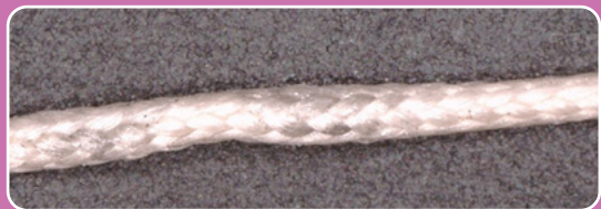
#2 Vicryl Suture