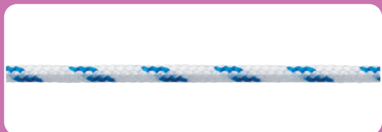
#2 ULTRABRAID Suture