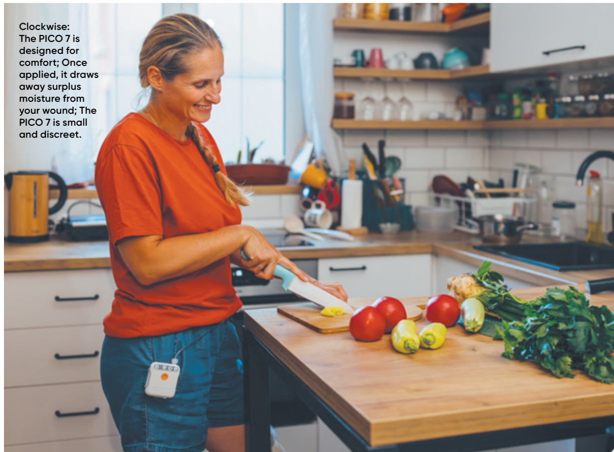
Clockwise: The PICO 7 is designed for comfort; Once applied, it draws away surplus moisture from your wound; The PICO 7 is small and discreet.