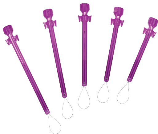
CAP-LIFT ◇ Cannula