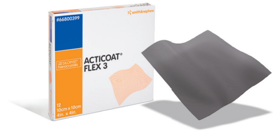
ACTICOAT ® FLEX 3 Antimicrobial Barrier Dressing

The wounds had epithelialised and the patient was advised to apply emollient moisturiser twice daily to the area.