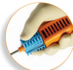
Step 2 - Twist