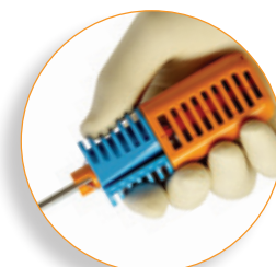
Step 1 - Ready

After placing anchor in the bone, please follow the steps below: