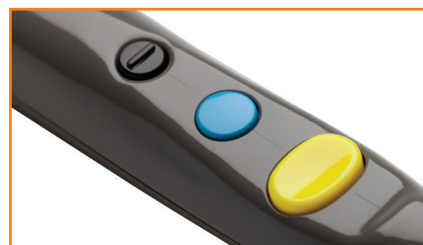
Improved Integrated Finger Switch (IFS) Technology