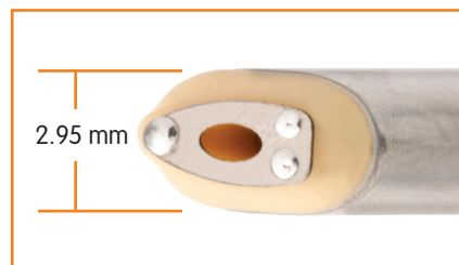
Slim electrode design facilitates access to targeted tissue