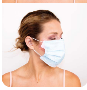
Device Surgical face mask Area at risk Cheeks, bridge of nose