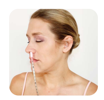
Device Nasogastric (NG) tube (secure NG tube according to local protocol) Area at risk Nose, upper lip