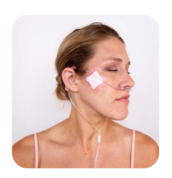
Device Nasal oxygen cannula/tube Area at risk Upper lip, cheek, ear