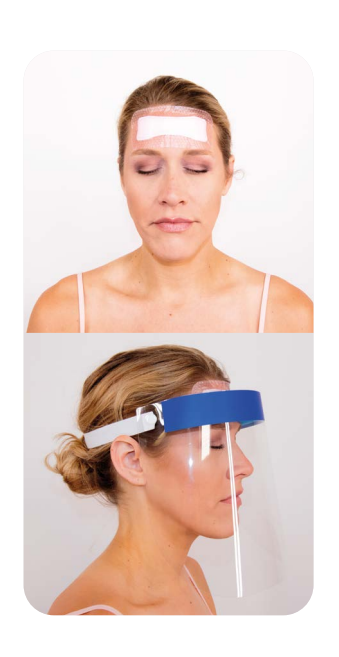
Device Face shield Area at risk Forehead