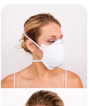
N95 face mask Area at risk Cheeks, bridge of nose