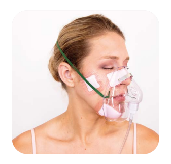
Device Oxygen mask Area at risk Cheeks, bridge of nose, chin