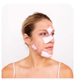
Non-invasive positive pressure ventilation (NIPPV)/Continuous positive airway pressure (CPAP) mask Area at risk Forehead, cheeks,