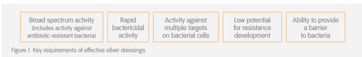
Figure 1. Key requirements of effective silver dressings