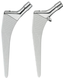
126° Lateral Offset Stems